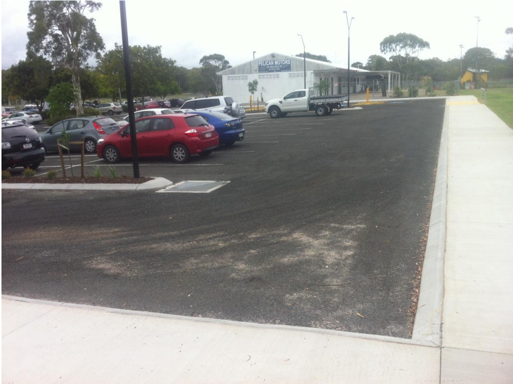
Figure 2 Pavement Failure at Caloundra Tennis Centre