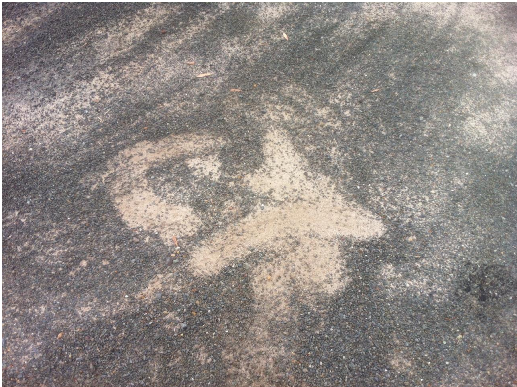
Figure 3 Pavement Aggregate Pooling around Turning Circles and Easily Removed